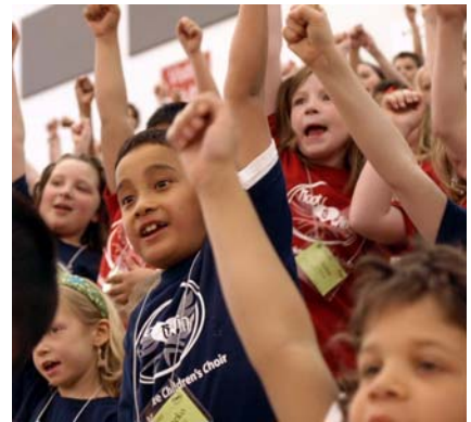
Some of the 400+ children who spent the day with MCC at Roots & Wings 2010