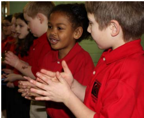
Prelude Singers hard at “work” during rehearsal.