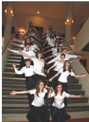
Jubilate in the Marcus center After singing Stravinsky’s Symphony of Psalms with MSO